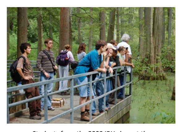
Students from the 2009 IBH class at the Heron Pond cypress swamp, southern Illinois