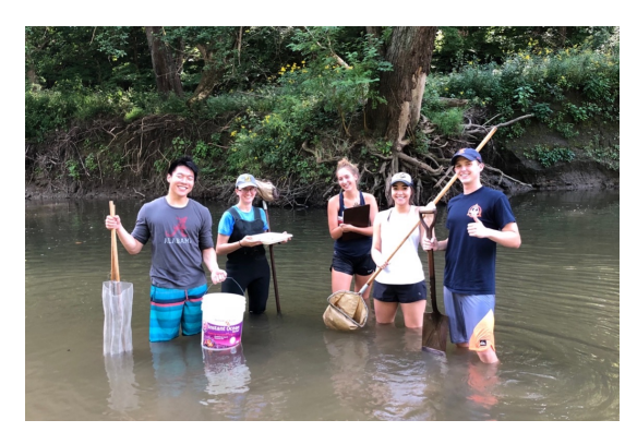
Members of the 2018 IBH class collecting invertebrates in the Salt Fork River

Right: IB students mapping trees in Trelease Woods. It took 70 students two years to generate maps of all 31,948 trees in Trelease.