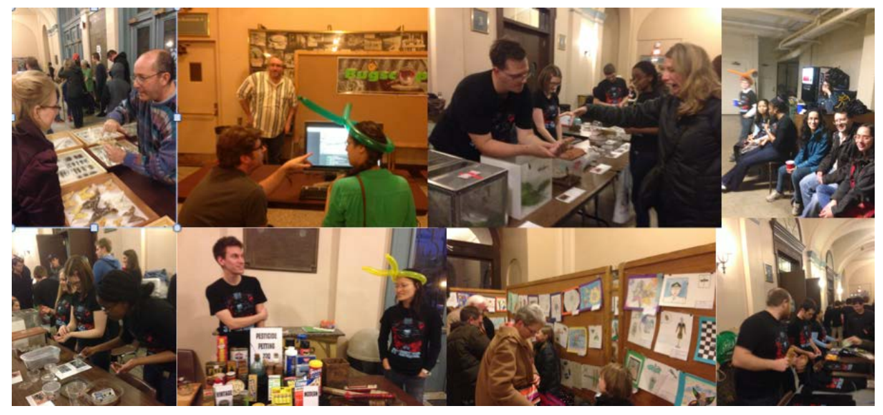
Scenes from the 31<sup>st</sup> Annual Insect Fear Film Festival (Pesticide Fear Films), 2014.