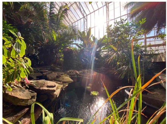
A view of the flowers and newly renovated pond in the Plant Biology Conservatory.