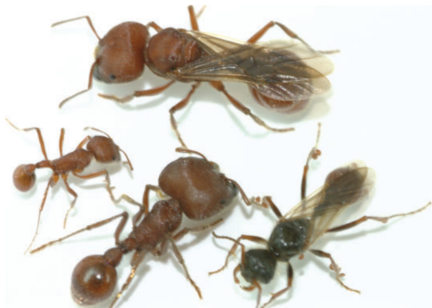
Fig. 1. The four castes of the Florida harvester ant ( Pogonomyrmex badius ). Clockwise from the top: reproductive female (gyne), male, major worker and minor worker.